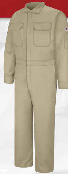
PREMIUM COVERALL CLB2KH | Protection: Arc Rating ATPV 8.6 calories/cm 2 Also available in Navy (NV), Royal Blue (RB)