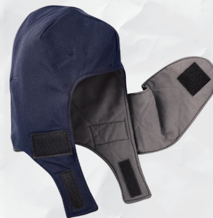
HARD HAT LINER & FACE MASK HNL2NV | HNM2NV | CAT LS NW Protection: Arc Rating E BT 37 calories/cm²