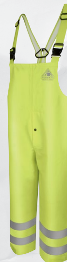
HI-VISIBILITY FLAME-RESISTANT RAIN BIB OVERALL BXN4YE | Protection: Arc Rating ATPV 19 calories/cm² EBTAS 28 calories/cm²