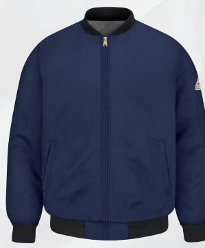
TEAM JACKET | JET2NV | Protection: Arc Rating ATPV 52 calories/cm 2