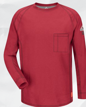
iQ SERIES™ LONG SLEEVE T-SHIRT

Also available in Black (BK), Blue (BL), Dark Blue (DB), Red (RD), Stone (TN)