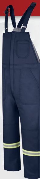
DELUXE INSULATED BIB OVERALL WITH REFLECTIVE TRIM BLC2NV | Protection: Arc Rating ATPV 43 calories/cm²