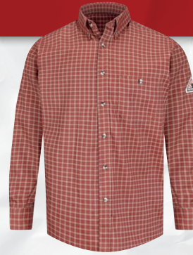
6.5 OZ. PLAID DRESS SHIRT | SLG8RK | Protection: Arc Rating ATPV 8.7 calories/cm 2 Also available in Red/Navy (RN), Hunter/Navy (HN)