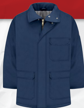
PARKA | JLP8NV | Protection: Arc Rating ATPV 43 calories/cm 2

For full product information, visit Bulwark.com .