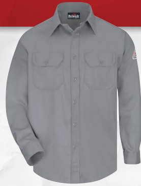
6 OZ. UNIFORM SHIRT | SLU8GY | Protection: Arc Rating ATPV 8.7 calories/cm 2 Also available in Khaki (KH), Light Blue (LB), Navy (NV), Orange (OR)

Banded, topstitched cuffs with adjustable button closures. Placket front with button closure. Tailored sleeve placket.