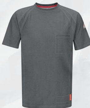
iQ SERIES™ SHORT SLEEVE T-SHIRT

Also available in Black (BK), Blue (BL), Charcoal (CH), Dark Blue (DB), Stone (TN)