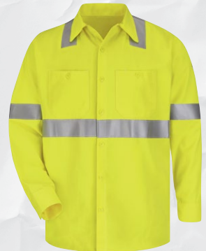
HI-VISIBILITY FLAME-RESISTANT WORK SHIRT | SMW4HV | Protection: Arc Rating ATPV 9 calories/cm 2