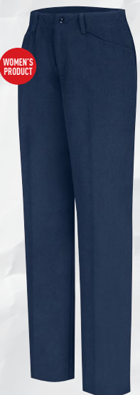
WOMEN'S 7 OZ. WORK PANT PMW3NV | Protection: Arc Rating ATPV 10 calories/cm 2