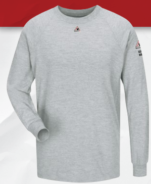
LONG SLEEVE PERFORMANCE T-SHIRT SMT2GY | Protection: Arc Rating ATPV 8.2 calories/cm 2 Also available in Khaki (KH), Navy (NV)