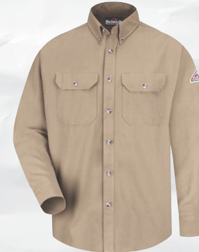
7 OZ. DRESS UNIFORM SHIRT SMU2KH | Protection (Navy): Arc Rating ATPV 10 calories/cm 2 Protection (Khaki, Light Blue): Arc Rating ATPV 9 calories/cm 2 Also available in Light Blue (LB), Navy (NV)