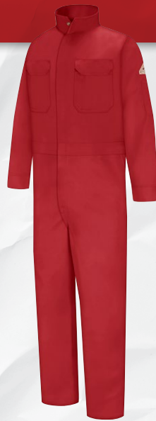
PREMIUM COVERALL CEB2RD | Protection: Arc Rating ATPV 11 calories/cm 2 Also available in Khaki (KH), Medium Grey (GY), Navy (NV), Royal Blue (RB)

For full product information, visit Bulwark.com .