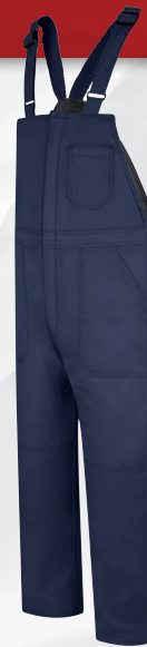
DELUXE INSULATED BIB OVERALL BNN2NV | Protection: Arc Rating E BT 62 calories/cm²