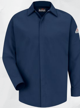
CONCEALED-GRIPPER POCKETLESS WORK SHIRT SMS2NV | Protection (Navy): Arc Rating ATPV 10 calories/cm 2 Protection (Grey, Light Blue): Arc Rating ATPV 9 calories/cm 2 Also available in Grey (GY), Light Blue (LB)