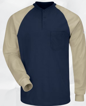
LONG SLEEVE COLOR-BLOCKED TAGLESS HENLEY SHIRT SEL4NK | Protection: Arc Rating ATPV 9.6 calories/cm 2