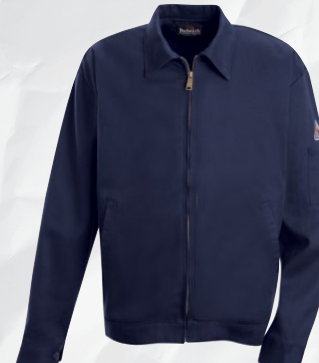
ZIP-IN / ZIP-OUT JACKET JEW2NV | Protection: Arc Rating ATPV 11 calories/cm 2