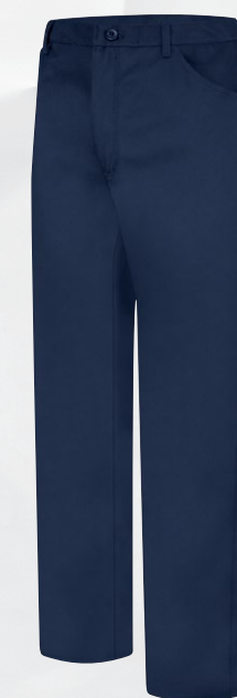
9 OZ. JEAN-STYLE PANT PEJ2NV | Protection: Arc Rating ATPV 11 calories/cm 2