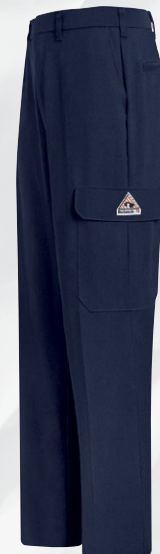
7 OZ. COOLTOUCH® 2 CARGO POCKET PANT PMU2NV | Protection (Navy): Arc Rating ATPV 10 calories/cm 2 Protection (Khaki): Arc Rating ATPV 9 calories/cm 2 Also available in Khaki (KH)