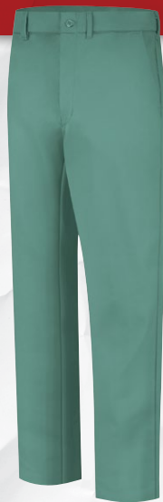
9 OZ. WORK PANT PEW2VG | Protection: Arc Rating ATPV 11 calories/cm 2 Also available in Charcoal (CH), Khaki (KH), Navy (NV)

For full product information, visit Bulwark.com .