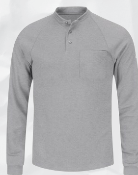
LONG SLEEVE HENLEY SHIRT SML2GY | Protection: Arc Rating E pr 8.2 calories/cm 2 Also available in Khaki (KH), Navy (NV)