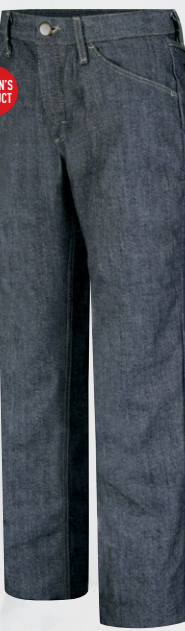
WOMEN'S CURVY FIT DENIM BLEND JEAN | PMJ5DD | Protection: Arc Rating E BT 13 calories/cm 2