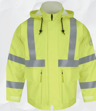
HI-VISIBILITY FR RAIN JACKET JXN4YE | Protection: Arc Rating ATPV 19 calories/cm 2 EBTAS 28 calories/cm 2