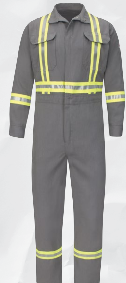
PREMIUM COVERALL WITH REFLECTIVE TRIM CMBCCGY | Protection: Arc Rating ATPV 9 calories/cm 2 Also available in Royal Blue (RB)