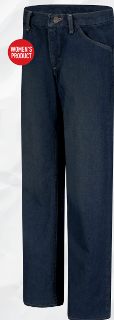
WOMEN'S STRAIGHT FIT SANDED DENIM JEAN | PEJWSD | Protection: Arc Rating ATPV 18 calories/cm 2