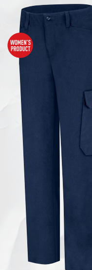
WOMEN'S 7 OZ. COOLTOUCH® 2 CARGO POCKET PANT PMU3NV | Protection: Arc Rating ATPV 10 calories/cm 2