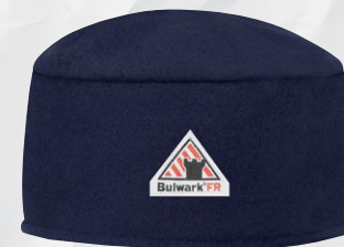
FLEECE BEANIE | HMC4NV | CAT NW Protection: Arc Rating E BT 11 calories/cm²