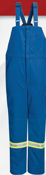
DELUXE INSULATED BIB OVERALL WITH REFLECTIVE TRIM BNNTRB | Protection: Arc Rating E BT 62 calories/cm²