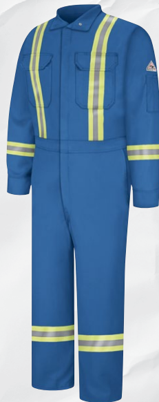
PREMIUM COVERALL WITH REFLECTIVE TRIM CLBTRB | Protection: Arc Rating ATPV 12 calories/cm 2