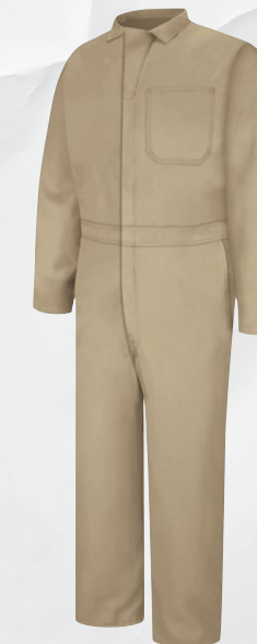
CLASSIC COVERALL CNC2TN | Protection: Arc Rating ATPV 4.4 calories/cm² Also available in Navy (NV), Royal Blue (RB)