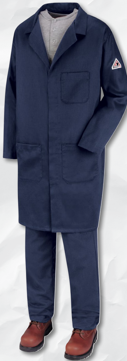
SHIRT | SML2GY | page 9 LAB COAT | KLL6NV | page 17 PANT | PMU2NV | page 12