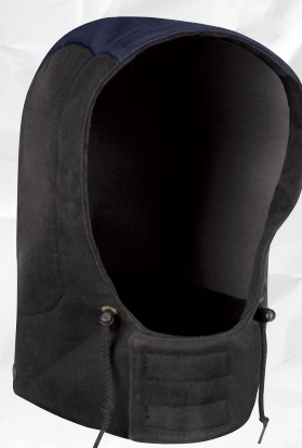
FR3 HOOD | HLH6BN | CAT NW Protection: Arc Rating E BT 26 calories/cm²