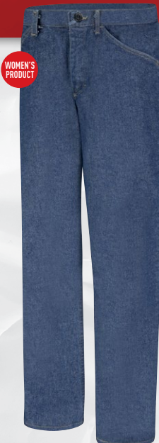
WOMEN'S CLASSIC FIT PRE-WASHED JEAN | PEJ3DW | Protection: Arc Rating ATPV 21 calories/cm 2