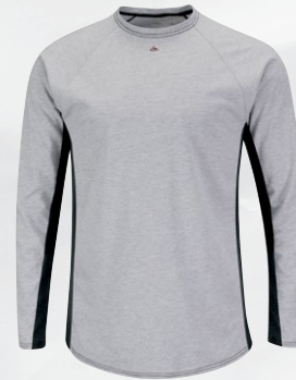
LONG SLEEVE FR TWO-TONED BASE LAYER | MPU8GY | Protection: Arc Rating ATPV 6.4 calories/cm 2