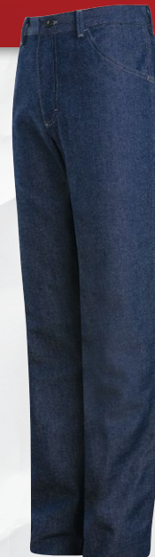
MEN'S CLASSIC FIT PRE-WASHED JEAN | PEJ4DW | Protection: Arc Rating ATPV 21 calories/cm 2