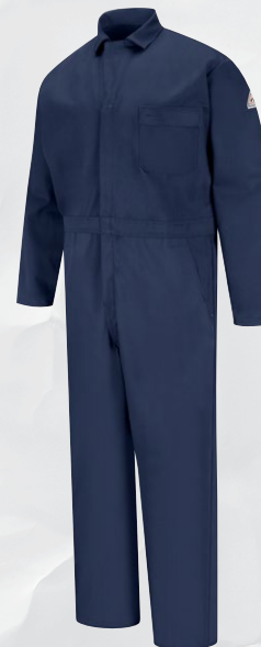
CLASSIC COVERALL CEH2NV | Protection: Arc Rating ATPV 11 calories/cm²