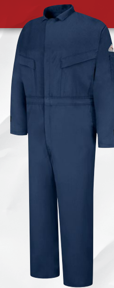
DELUXE COVERALL CLZ4NV | Protection: Arc Rating ATPV 8.7 calories/cm²