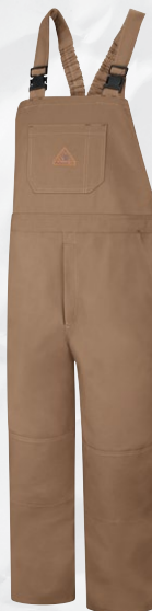
DUCK UNLINED BIB OVERALL BLF8BD | Protection: Arc Rating ATPV 15 calories/cm² Also available in Navy Duck (NV)