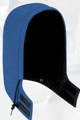
UNIVERSAL FIT SNAP-ON INSULATED HOOD - NOMEX® IIIA HHH2RB | CAT LS NW Protection: Arc Rating E BT 62 calories/cm² Also available in Navy (NV)