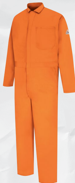
CLASSIC COVERALL CEC20R | Protection: Arc Rating ATPV 10.6 calories/cm² Also available in Khaki (KH), Navy (NV), Royal Blue (RB)

For full product information, visit Bulwark.com .