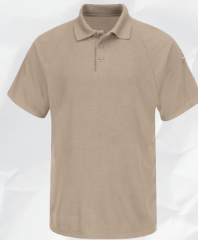
SHORT SLEEVE CLASSIC POLO SMP8KH | Protection: Arc Rating E pr 8.2 calories/cm 2 Also available in Grey (GY), Navy (NV)