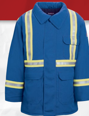
PARKA WITH REFLECTIVE TRIM JLPTRB | Protection: Arc Rating ATPV 43 calories/cm 2