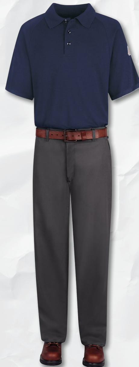
POLO | SMP8NV | page 9 PANT | PEW2CH | page 12