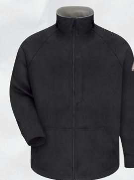
FR3 JACKET | JLF6BK | Protection: Arc Rating E BT 26 calories/cm 2 Also available in Navy (NV)