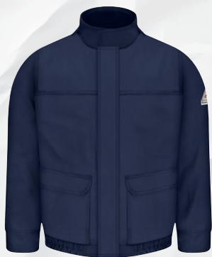
LINED BOMBER JACKET JIJ8NV | Protection: Arc Rating ATPV 30 calories/cm 2 Also available in Royal Blue (RB)