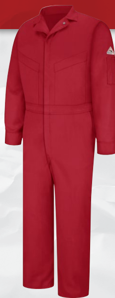
DELUXE COVERALL CLD4RD | Protection: Arc Rating ATPV 8.7 calories/cm² Also available in Grey (GY), Khaki (KH), Navy (NV), Royal Blue (RB)