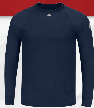
LONG SLEEVE TAGLESS T-SHIRT SMT4NV | Protection: Arc Rating ATPV 8.1 calories/cm 2