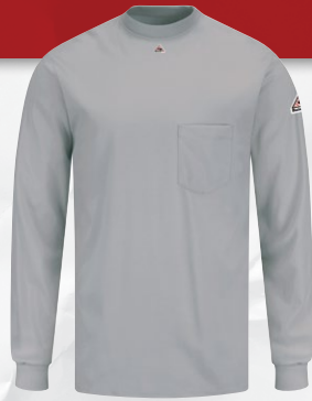
LONG SLEEVE TAGLESS T-SHIRT SET2GY | Protection: Arc Rating ATPV 9.6 calories/cm 2 Also available in Navy (NV)

Self fabric crewneck-style collar and hemmed sleeves. Tagless brand and warning label. Full side seam gusset.