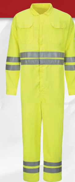
DELUXE COVERALL CMD8HV | Protection: Arc Rating ATPV 8.4 calories/cm²