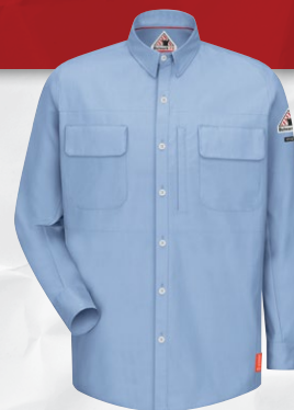
iQ SERIES™ LONG SLEEVE PATCH POCKET SHIRT

Also available in Charcoal (CH), Light Tan (LT), Red (RD)