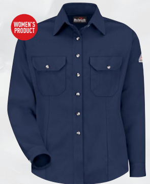
WOMEN'S 7 OZ. DRESS UNIFORM SHIRT SMU3NV | Protection (Navy): Arc Rating ATPV 10 calories/cm 2 Protection (Khaki, Light Blue): Arc Rating ATPV 9 calories/cm 2 Also available in Khaki (KHB), Light Blue (LB)