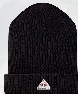
KNIT CAP | HMC2BK | CAT NW Protection: Arc Rating E BT 28 calories/cm²