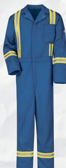
CLASSIC COVERALL WITH REFLECTIVE TRIM CECTR | Protection: Arc Rating ATPV 11 calories/cm² Also available in Navy (NV)