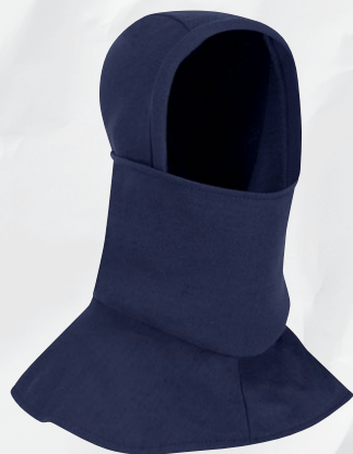
BALACLAVA WITH FACE MASK | HMB2NV | CAT NW Protection: Arc Rating ATPV 8.1 calories/cm²