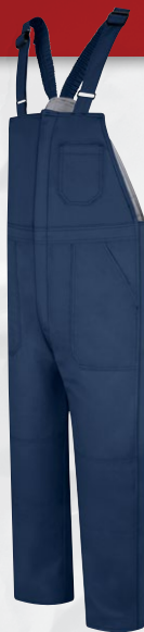
DELUXE INSULATED BIB OVERALL BLC8NV | Protection: Arc Rating ATPV 43 calories/cm² Also available in Royal Blue (RB)

For full product information, visit Bulwark.com .