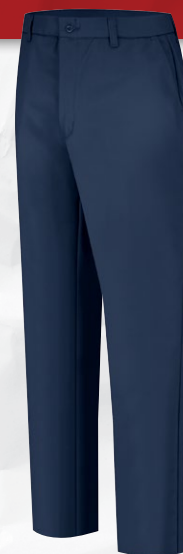
9 OZ. WORK PANT PLW2NV | Protection: Arc Rating ATPV 12 calories/cm 2 Also available in Khaki (KH)