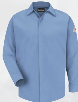
CONCEALED-GRIPPER POCKETLESS WORK SHIRT SLS2LB | Protection: Arc Rating ATPV 8.6 calories/cm 2 Also available in Navy (NV)

Banded, button-down collar. Cuffs with button closure. Button-front placket.