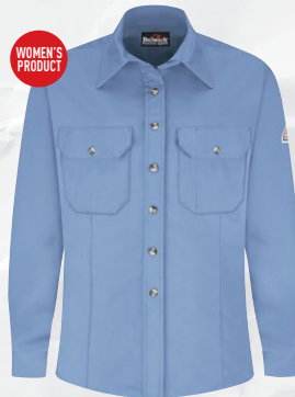
WOMEN'S 7 OZ. DRESS UNIFORM SHIRT SLU3LBB | Protection: Arc Rating ATPV 8.6 calories/cm 2 Also available in Khaki (KH), Navy (NVB), Royal Blue (RBB), Silver Grey (SYB)