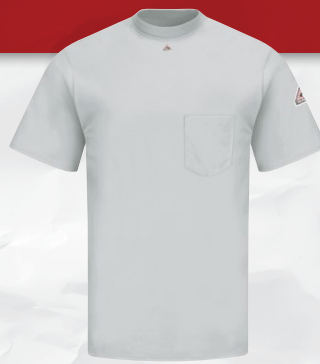
SHORT SLEEVE TAGLESS T-SHIRT SET8OR | Protection: Arc Rating ATPV 9.6 calories/cm 2 Also available in Navy (NV)