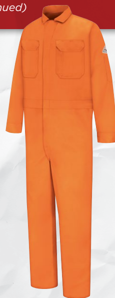
DELUXE COVERALL CED20R | Protection: Arc Rating ATPV 11 calories/cm² Also available in Khaki (KH), Navy (NV), Royal Blue (RB)

For full product information, visit Bulwark.com .