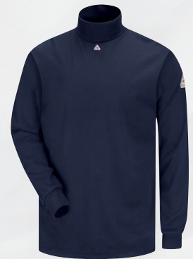
TAGLESS MOCK TURTLENECK SEK2NV | Protection: Arc Rating ATPV 9.6 calories/cm 2

For full product information, visit Bulwark.com .