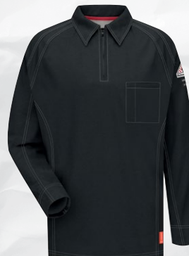
iQ SERIES™ LONG SLEEVE POLO

Also available in Black (BK), Blue (BL), Charcoal (CH), Red (RD), Stone (TN)