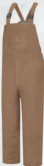
DELUXE INSULATED BIB OVERALL BLN4BD | Protection: Arc Rating ATPV 56 calories/cm²