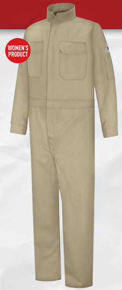
WOMEN'S PREMIUM COVERALL CLB7KHB | Protection: Arc Rating ATPV 12 calories/cm 2 Also available in Navy (NV), Royal Blue (RB)