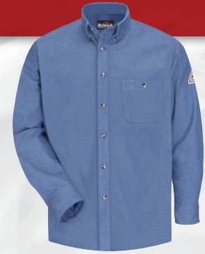
7 OZ. DENIM DRESS SHIRT SEG2LD | Protection: Arc Rating ATPV 8 calories/cm 2