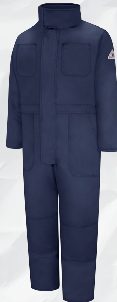
PREMIUM COVERALL CNN2NV | Protection: Arc Rating E at 62 calories/cm 2