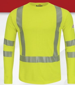
HI-VISIBILITY FLAME-RESISTANT LONG SLEEVE T-SHIRT | SMK2HV | Protection: Arc Rating ATPV 8.1 calories/cm 2