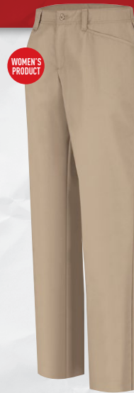
WOMEN'S 9 OZ. WORK PANT PLW3KHB | Protection: Arc Rating ATPV 12 calories/cm 2 Also available in Navy (NVB)