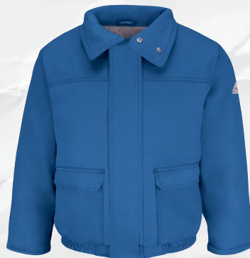
INSULATED BOMBER JACKET JLR8RB | Protection: Arc Rating ATPV 43 calories/cm 2 Also available in Navy (NV)