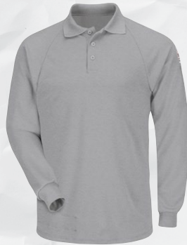
LONG SLEEVE CLASSIC POLO SMP2GY | Protection: Arc Rating E pr 8.2 calories/cm 2 Also available in Khaki (KH), Navy (NV)

Self-fabric crewneck collar. Tagless. Raglan sleeves. Heatseal Bulwark® triangle centered at neck to show wearer has on FR undergarment.