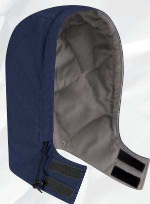
UNIVERSAL FIT SNAP-ON HOOD EXCEL FR® COMFORTOUCH® HLH2NV | CAT IL LS NW Protection: Arc Rating ATPV 43 calories/cm² Also available in Orange (OR), Royal Blue (RB)

For full product information, visit Bulwark.com .