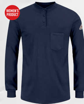
WOMEN'S LONG SLEEVE TAGLESS HENLEY SHIRT | SEL3NV | Protection: Arc Rating ATPV 9.6 calories/cm 2