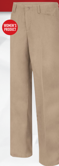
WOMEN'S 9 OZ. WORK PANT PEW3KHB | Protection: Arc Rating ATPV 11 calories/cm 2 Also available in Navy (NV)