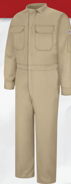
DELUXE COVERALL CMD6KH | Protection (Khaki): Arc Rating ATPV 9 calories/cm² Protection (Navy): Arc Rating ATPV 10 calories/cm² Also available in Navy (NV)