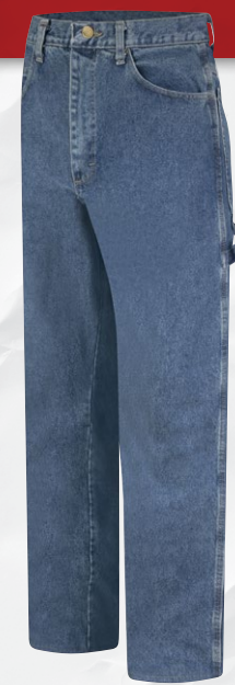
MEN'S PRE-WASHED DENIM DUNGAREE PEJ8SW | Protection: Arc Rating ATPV 21 calories/cm 2 Also available in Blue Denim (DW)