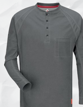
iQ SERIES™ HENLEY | QT20CH |

Also available in Black (BK), Blue (BL), Charcoal (CH), Dark Blue (DB), Stone (TN)