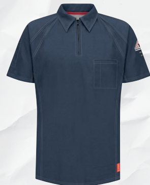
iQ SERIES™ SHORT SLEEVE POLO

For full product information, visit Bulwark.com .