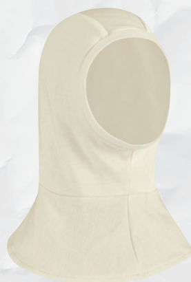
KNIT BALACLAVA | HNB2NA | CAT NW Protection: Arc Rating ATPV 26 calories/cm²