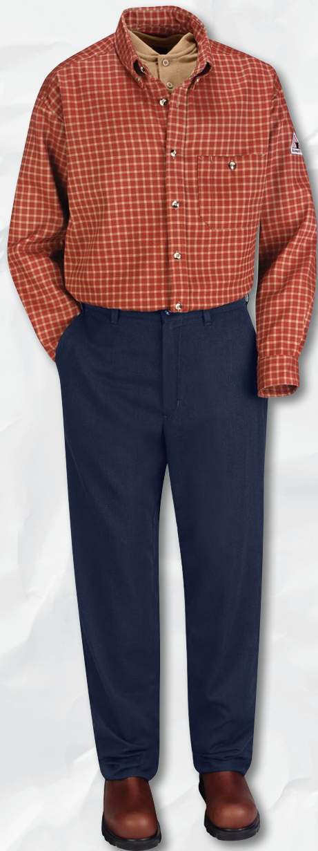
HENLEY | SML2KH | page 9 SHIRT | SLG8RK | page 8 PANT | PMW2NV | page 12