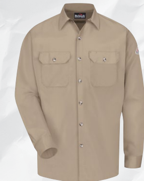
7 OZ. WORK SHIRT SLW2KH | Protection: Arc Rating ATPV 8.6 calories/cm 2 Also available in Light Blue (LB), Navy (NV)