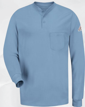
LONG SLEEVE TAGLESS HENLEY SHIRT SEL2LB | Protection: Arc Rating ATPV 9.6 calories/cm 2 Also available in Grey (GY), Khaki (KH), Navy (NV), Orange (OR)

Double-layer, rib knit collar sized to protect the neck. Rib knit cuffs. Tagless brand label and warning label.