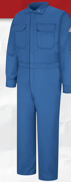
PREMIUM COVERALL CLB6RB | Protection: Arc Rating ATPV 12 calories/cm 2 Also available in Khaki (KH), Navy (NV)