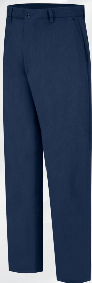
7 OZ. WORK PANT PMW2NV | Protection: Arc Rating ATPV 10 calories/cm 2

For full product information, visit Bulwark.com .