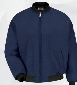
TEAM JACKET | JNT2NV | Protection: Arc Rating E BT 57 calories/cm 2