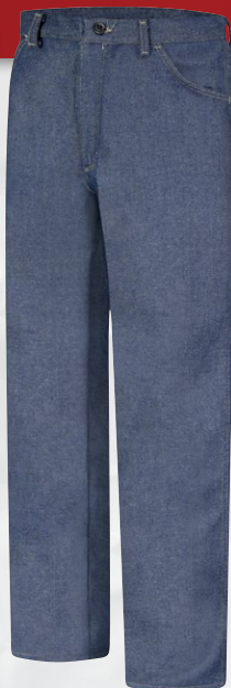
MEN'S RELAXED FIT JEAN PEJ2DD | Protection: Arc Rating ATPV 18 calories/cm 2

For full product information, visit Bulwark.com .