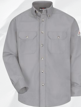
7 OZ. DRESS UNIFORM SHIRT SLU2SY | Protection: Arc Rating ATPV 8.6 calories/cm 2 Also available in Khaki (KH), Light Blue (LB), Navy (NV), Royal Blue (RB)

Banded, button-down collar. Cuffs with button closure. Button-front placket.