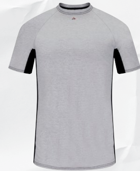
SHORT SLEEVE FR TWO-TONED BASE LAYER | MPU4GY | Protection: Arc Rating ATPV 6.4 calories/cm 2