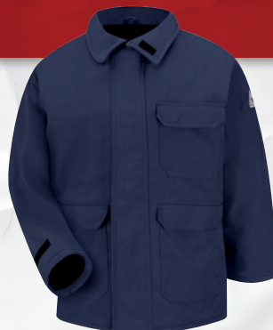
PARKA | JNP2NV | Protection: Arc Rating E BT 62 calories/cm 2 Also available in Royal Blue (RB)