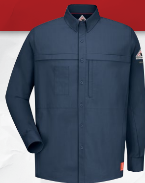
iQ SERIES™ LONG SLEEVE CONCEALED POCKET SHIRT

For full product information, visit Bulwark.com .