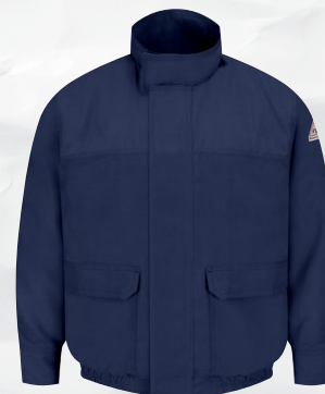
LINED BOMBER JACKET JNJ8NV | Protection: Arc Rating ATPV 13 calories/cm 2 Also available in Royal Blue (RB)