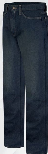
MEN'S STRAIGHT FIT SANDED DENIM JEAN | PEJMSD | Protection: Arc Rating ATPV 18 calories/cm 2