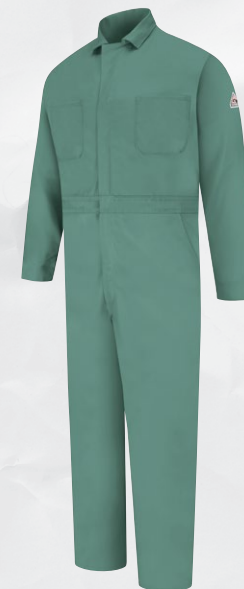
CLASSIC COVERALL CEW2VG | Protection: Arc Rating ATPV 11 calories/cm²