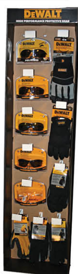
9354-DPG (Wire) 9355-DPG (Corrugated)