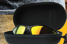
Eyewear Case (see p. 16)