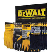
9525 Countertop format (holds 24 pairs)