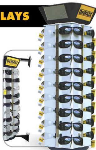
9667 Wall mounting brackets for 9522