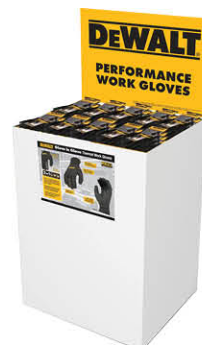
DB-DPG737 Holds 54 pair DPG737