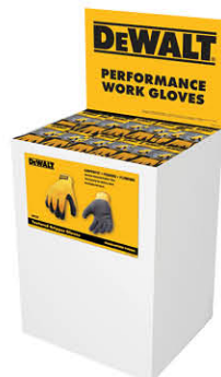
DB-DPG70 Holds 96 pair DPG70