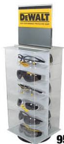
9523 12 pair