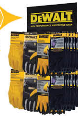
9525 Wall format (holds 48 pairs)

9531 96-pair Display with 9540 (DEWALT HEADER)