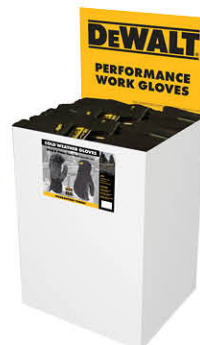
DB-DPG740 Holds 48 pair DPG740