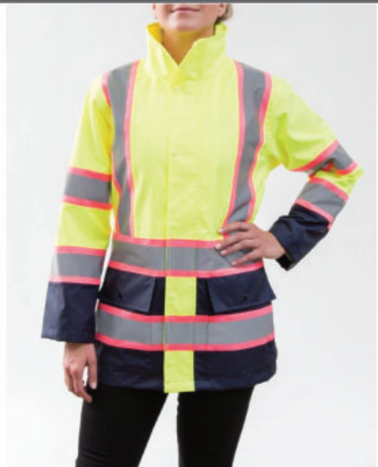
UHV825 Rain Jacket