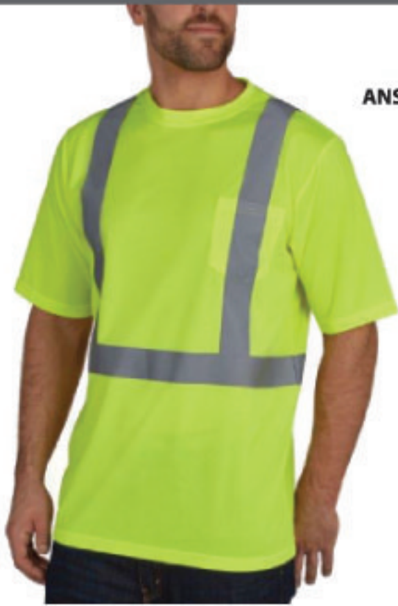
UHV303 ANSI/ISEA 107-2015 Type R, Class 2