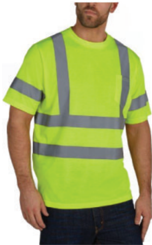
UHV302 ANSI/ISEA 107-2015 Type R, Class 3