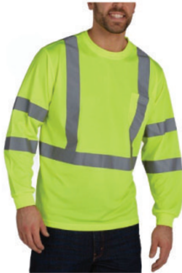
UHV403 ANSI/ISEA 107-2015 Type R, Class 3